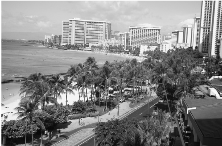
Waikiki Beach in Honolulu

PRSRT STD U.S. POSTAGE PAID Permit No. 225 Little Rock, AR